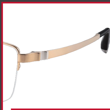
SLENDER, STREAMLINED TEMPLES

Discover sophisticated creative inspirations in slender, streamlined temples, smart end pieces that promise more flexibility and less pressure, and design elements that are both high-tech and high-end. Accented browlines, luxurious precious metal colouring and decorative enhancements set these attractive men's frames apart from the crowd.