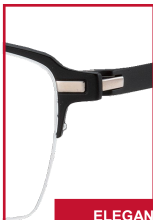
ELEGANT SILVER DETAILS

When it comes to eyewear frames, superior comfort, top quality and stylish design are the must-haves for refined, modern men with a penchant for technology. The CHARMANT Z collection ticks all of these boxes. These Japanese engineered and made premium frames are carved out of high-quality, bio-compatible titanium and come with ergonomic features that offer wearers unheard of lightness and comfort.