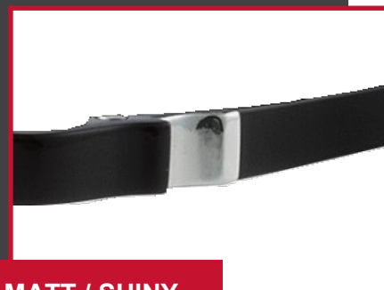
MATT / SHINY CONTRASTS

Discover sophisticated creative inspirations in slender, streamlined temples, smart end pieces that promise more flexibility and less pressure, and design elements that are both high-tech and high-end. Accented browlines, luxurious precious metal colouring and decorative enhancements set these attractive men's frames apart from the crowd.