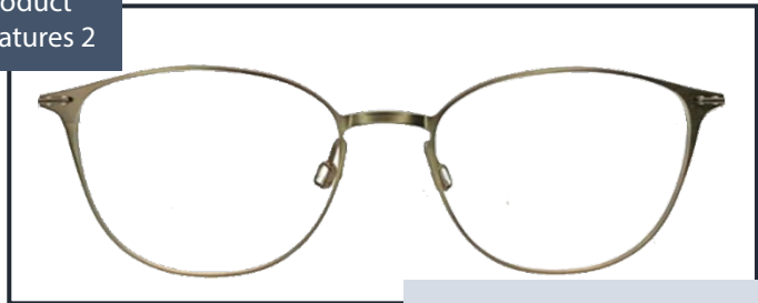
Thin milling front (Titanium)