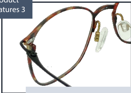
Pattern for whole milling front