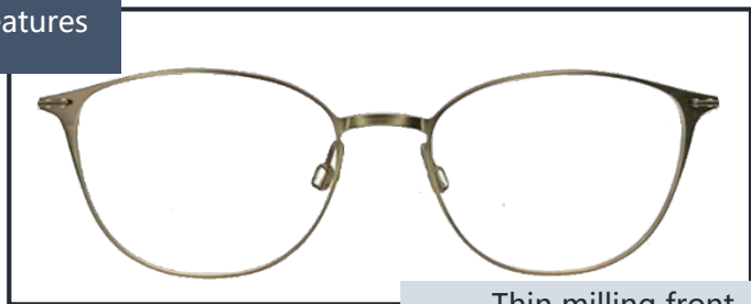
Thin milling front (Titanium)