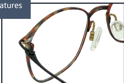
Pattern for whole milling front