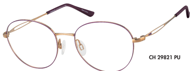
CH 29821 PU

■ For a more dynamic appearance, a square, oversized frame (CH29824) makes a striking impression and comes with a jewel-inspired temple decoration.