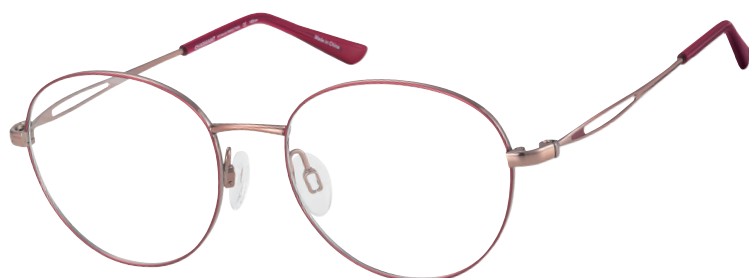
CH 29821 RE

Red, purple, green and beige rims (CH29821) create subtle accents that draw all looks.