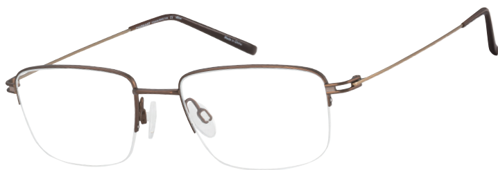
CH 29721 BR

Timeless elegance and superior weightlessness are enhanced in these men's frames through ultra-thin temples in flexible \beta -titanium.