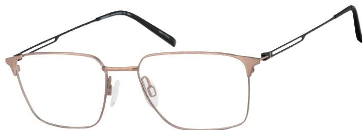
CH 29720 GD

■ This symmetrical, full-rimmed style features a discrete eye-brow density and cut-out temple lines in \beta -titanium (CH29719).