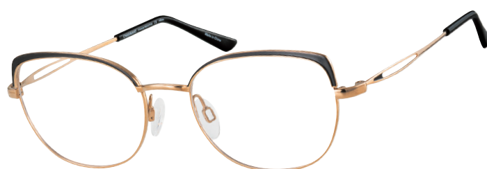
CH 29820 BK

This sensuous look (CH29820) takes eye definition a step further with distinctive browlines accented in tones of red, black, beige and violet. Slim temple lines and cut-outs complement the statement-making vibe of the rims.