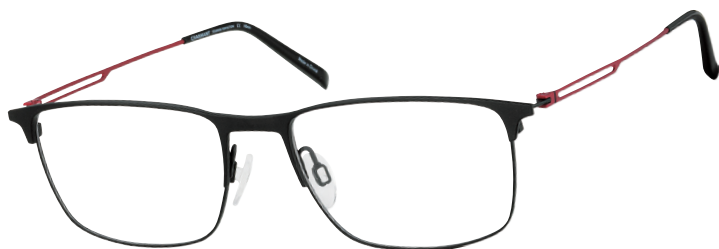
CH 29719 BK

These structured men's frames are a pure expression of CHARMANT Titanium Perfection high-tech design precision.