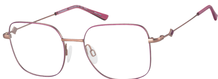
CH 29824 PK

This square expression (CH29824) uses rim colours in purple pink, beige and grey to embellish the frame's elegant simplicity and enhance beautiful eyes.