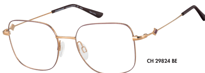
CH 29824 BE