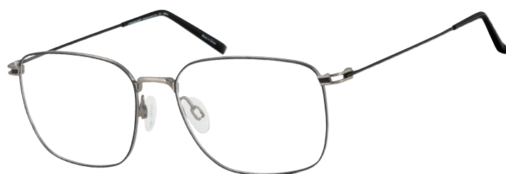
CH 29722 LG

■ This striking nylon frame (CH29721) conveys even more light with its unique end-piece slit.