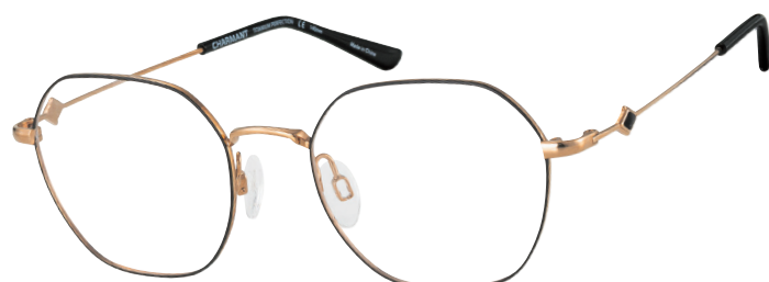
CH 29823 BK

On this striking geometric profile (CH29823), modern tones on octagonal rims and a colourful temple detail bring out the best in eyes and face.