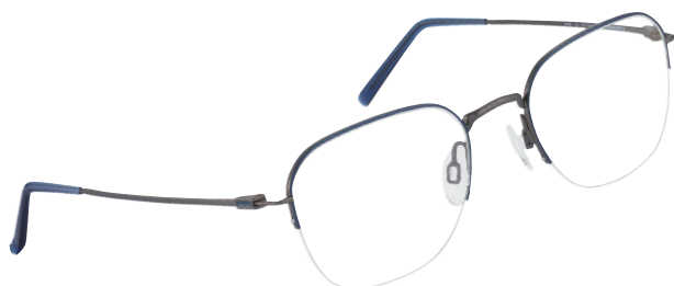
CH 29717 BL

Men's Charmant Titanium Perfection frames are a modern collection of rounded, rectangular and hexagonal shapes. Profiles are tastefully enhanced by attractive colour contrasting through hand-painted colour effects.