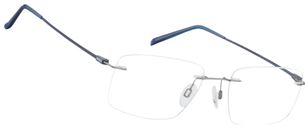
CH 29718 LG

Each new model has a note of designer individuality like a vintage bridge, sandblasted temples or a 3D temple detail in darker tones.