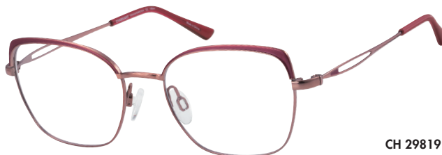
CH 29819 RE