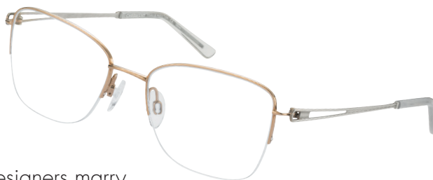
CH 29815 GP

Eyewear designers marry light with denser volumes in a collection of four sophisticated women's styles. Slender full-rimmed, semi-rimless and rimless frames are chic, contemporary and comfortable.