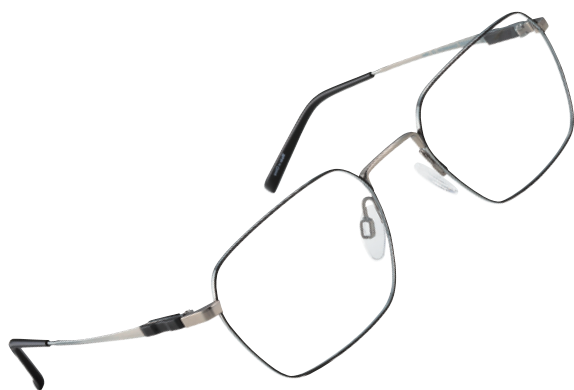
CH 29725 BK

Men's Charmant Titanium Perfection frames are a modern collection of rounded, rectangular and hexagonal shapes. Profiles are tastefully enhanced by attractive colour contrasting through hand-painted colour effects.