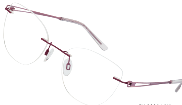
CH 29816 PK

Lightness is accentuated in airy temples and end-pieces, with cut-outs for added buoyancy. Neutral tones and warm berries are inviting colour selections for the new season.