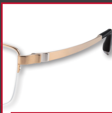
SLENDER, STREAMLINED TEMPLES

Discover sophisticated creative inspirations in slender, streamlined temples, smart end pieces that promise more flexibility and less pressure, and design elements that are both high-tech and high-end. Accented browlines, luxurious precious metal colouring and decorative enhancements set these attractive men's frames apart from the crowd.