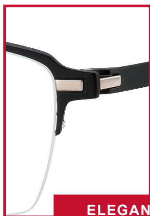
ELEGANT SILVER DETAILS

When it comes to eyewear frames, superior comfort, top quality and stylish design are the must-haves for refined, modern men with a penchant for technology. The CHARMANT Z collection ticks all of these boxes. These Japanese engineered and made premium frames are carved out of high-quality, bio-compatible titanium and come with ergonomic features that offer wearers unheard of lightness and comfort.