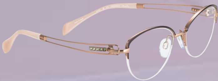
XL2172 (nylor) XL2173 & XL2174 (pressure-mount)

Temples, featuring four floating, coloured rhinestones, place these beautiful Vivace models in a league of their own.