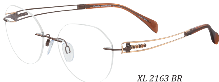
XL 2163 BR

You are always well dressed with a Line Art frame. These Vivace glasses are no exception to the rule. Line Art lightness is conveyed in the weightless feel, fine, angular rims and dainty, Excellence Titan temple lines. Round decorative elements, in two different tones, align the middle of the temple, adding individuality and sophistication. Frame and stone colours are beautifully coordinated.