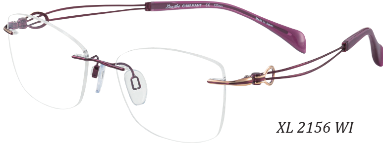
XL 2156 WI

These pretty Line Art Aria glasses make a clean first impression, but ornate temples create a dramatic contrast. The slender, slightly curving Excellence Titan lines pass through a petite ring conveying a chic jewellery vibe. Vivid shades of gold, wine and navy are revealed on the bridge and in two-toned temples. These superior glasses offer all-day comfort and stylish accessorising.