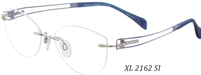
XL 2162 SI

This lively Vivace model mixes cool understatement with tasteful glamour. The rimless lens lifts the face thanks to its charming, catty profile. Temples are eye-catching and exquisite: a pair of slim Excellence Titan lines encloses a row of crystal-clear rhinestones. Intense colours and colour contrasts embellish and enrich this elegant profile.