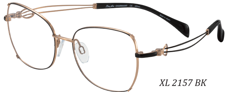
XL 2157 BK

For professional or private engagements, this delightful, full-rimmed Aria frame elevates every look. Colour accents emphasise the butterfly rim shape, tips and jewellery-like temple composition. The cube is discreetly fixed into the lower rim wire. Vivid colours in two-tones emphasise definition and underline the rich Line Art quality.